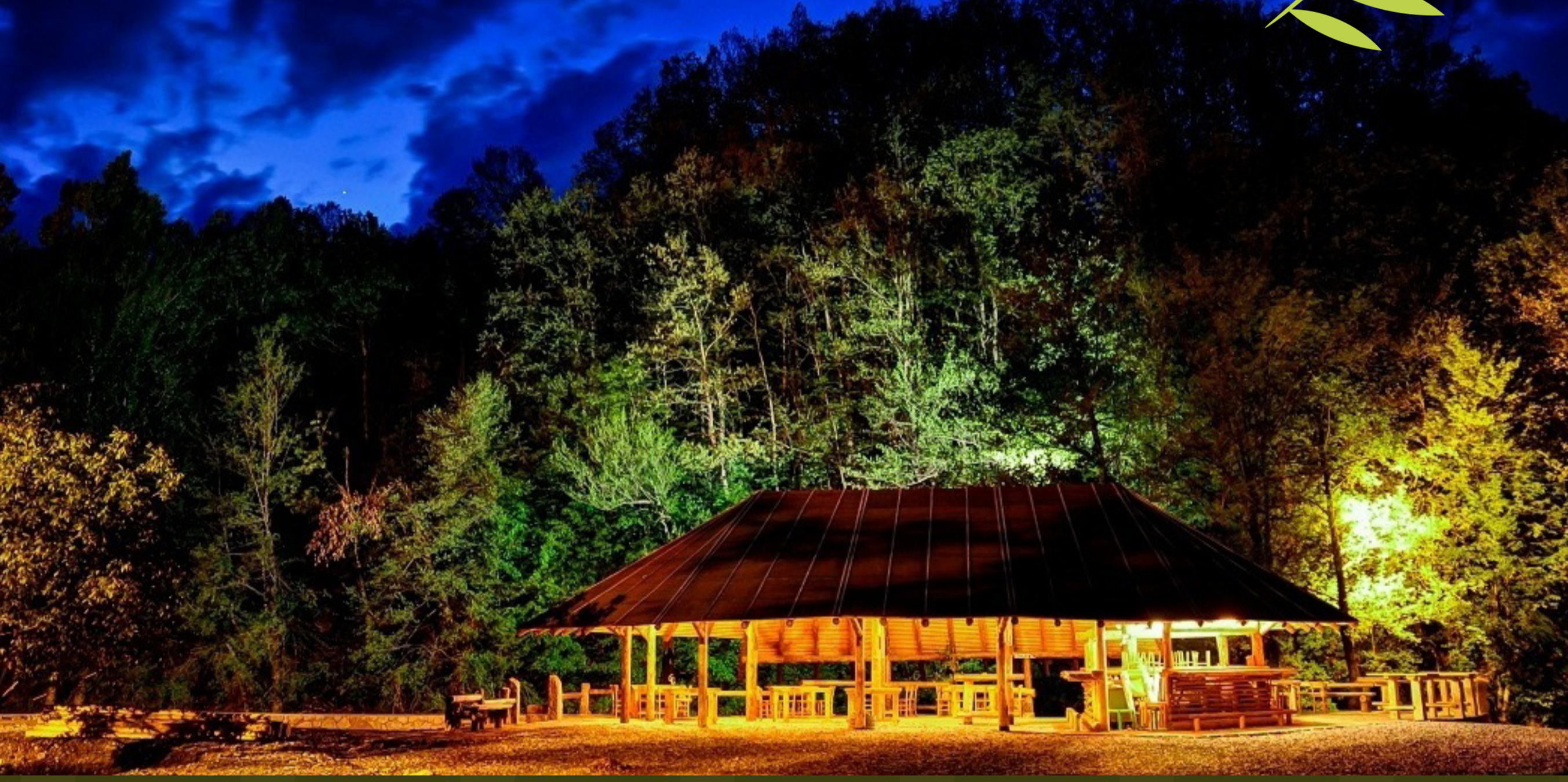
• Kupalište "Bosa noga" / Picnic place "Bosa noga"