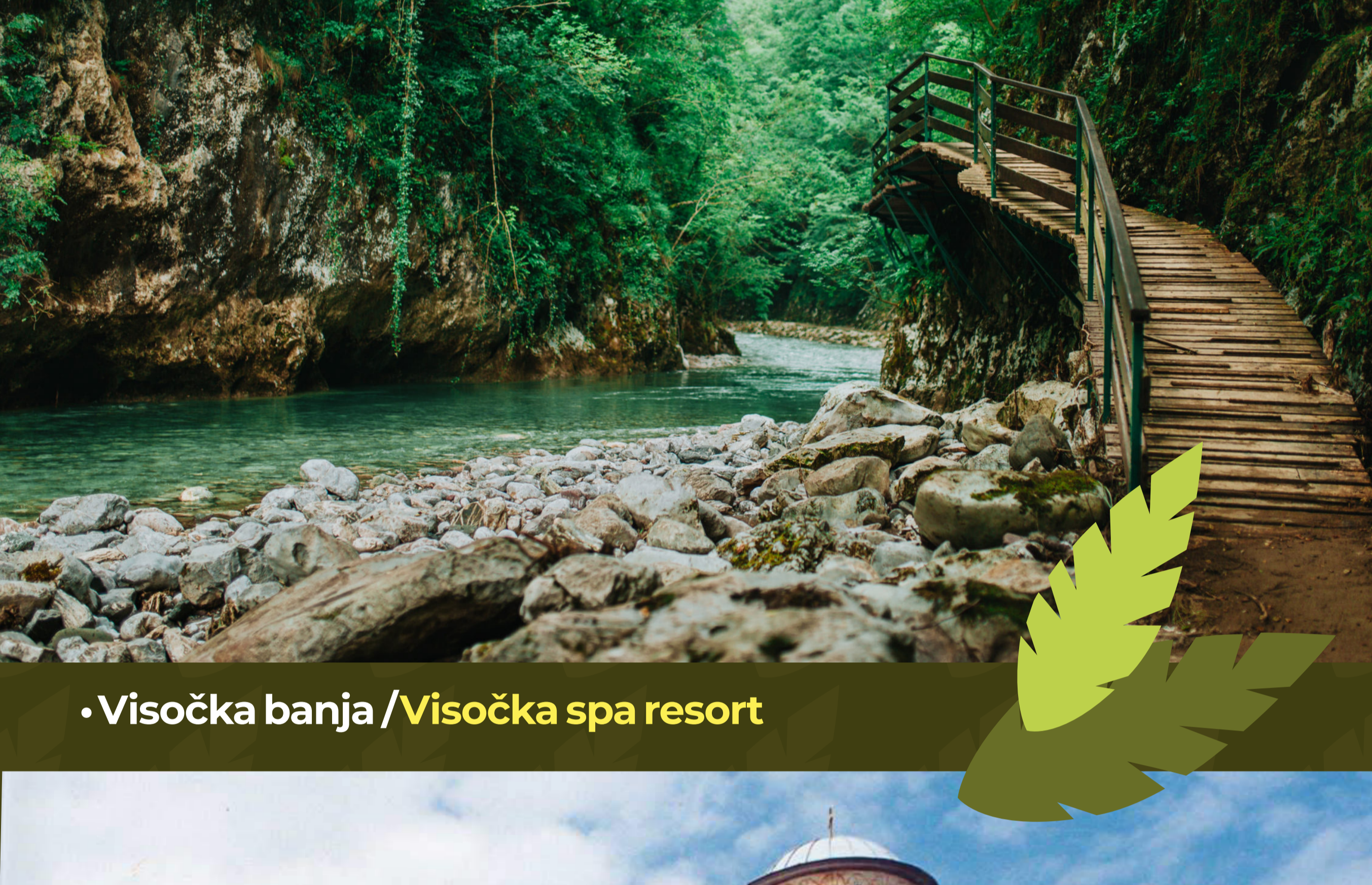
• Visočka banja / Visočka spa resort