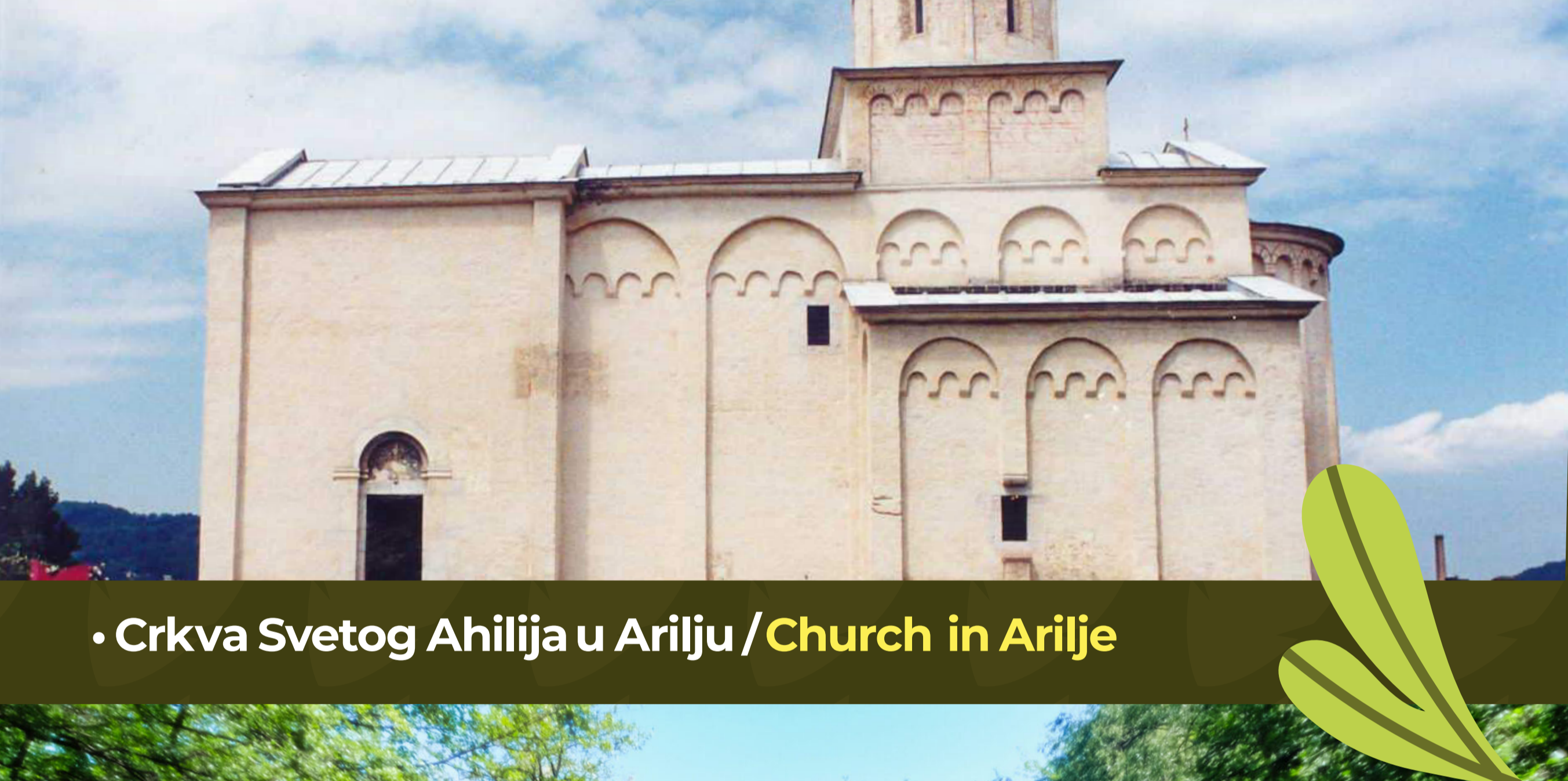
• Crkva Svetog Ahilija u Arilju / Church in Arilje