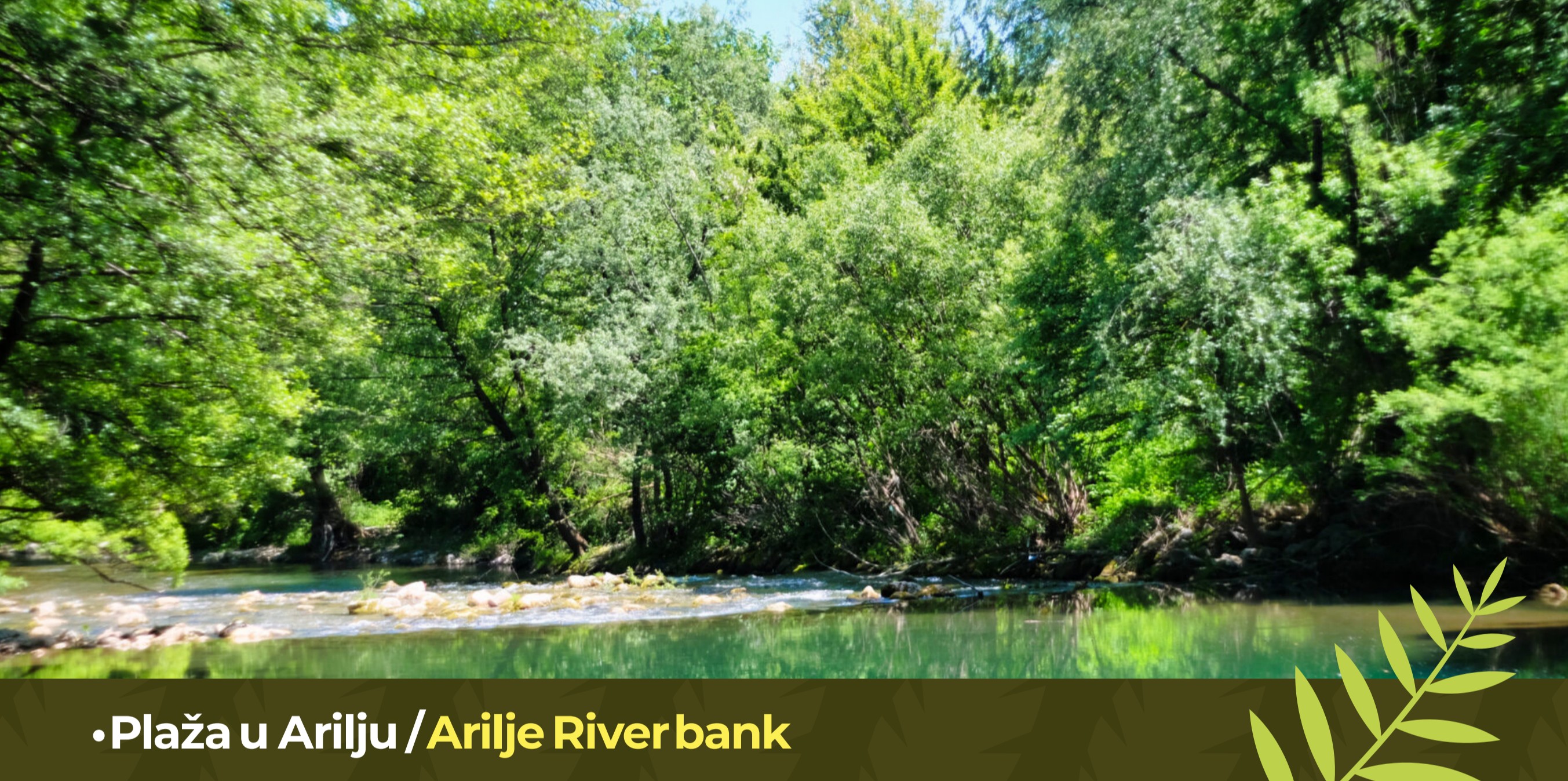
• Plaža u Arilju / Arilje Riverbank